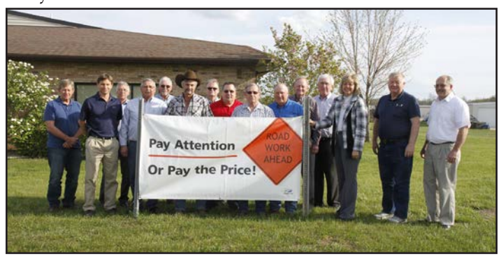
Members of the Transportation Advisory Committee (TAC) pose next to the Road Work Ahead Safety Sign after their April 2017 meeting. April is Work Zone Safety month.