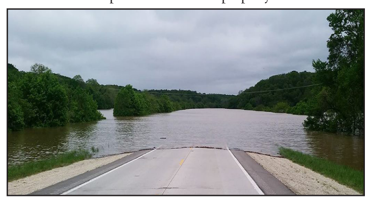
Flooding in April and May of 2017 blocked off many of the major roadways in the Meramec Region. Above water covers Hwy 63 near Vienna. Many of the roadways remained closed for days.