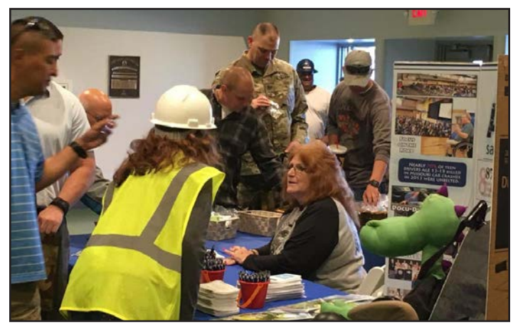
MRPC staff and members from the Roadway Safety Coalition provided information on seat belt safety and statistics on distracted driving at the Fort Leonard Wood Safety Day May 25, 2017.