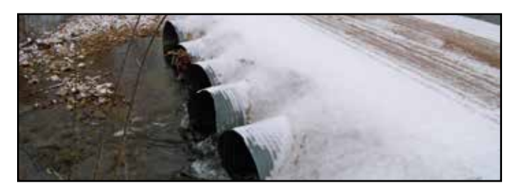
MRPC staff worked closely with Washington County officials to submit a CDBG grant to replace a low water crossing in Washington County.

• Awarded a CDBG grant to the county in the amount of $500,000 to replace the low water crossing over Mill Creek on Tiff Road.