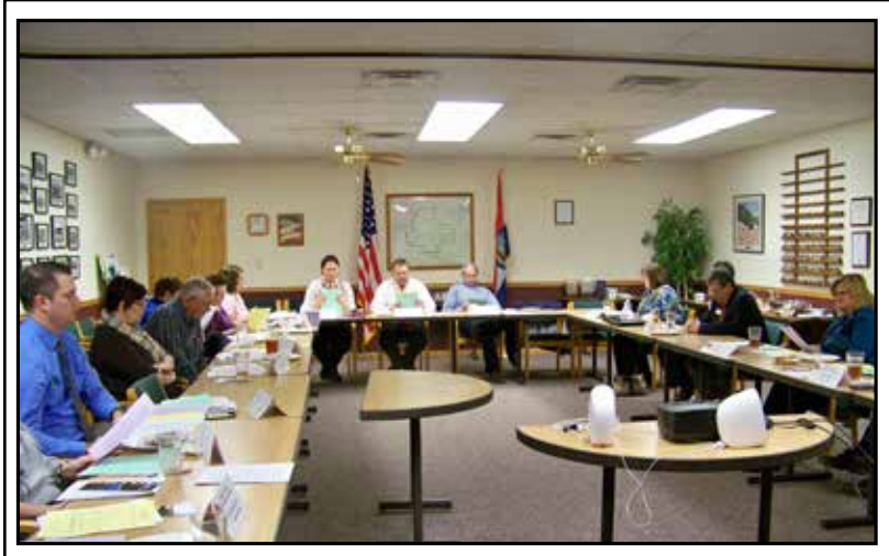
Meramec Regional Development Corporation (above) provides oversight for MRPC's loan programs.