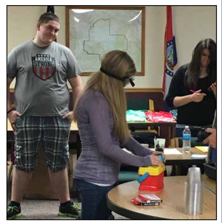
MRPC worked in partnership with the Missouri Coalition for Roadway Safety to coordinate docudrama safety day trainings, and assist with awareness of an "Arrive Alive" message to schools in the region. Students (above) tried to perform simple tasks while wearing intoxication simulator goggles.

• Coordinated four meetings of Region I Homeland Security Oversight Committee (HSOC).