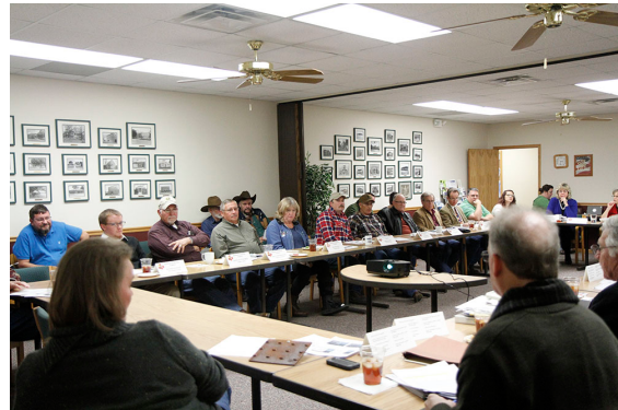
MRPC's Transportation Advisory Committee (TAC) gathered to vote on regional transportation priorities at the Dec. 8 meeting.